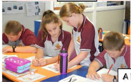
A helping hand.