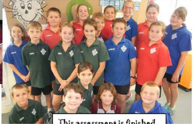
This assessment is finished.